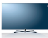
Table Stand, Chrome coating without Stereospeaker: W 100.0/H 64.8/PD 6.0/TD 35.1 with Stereospeaker: W 100.0/H 75.1/PD 6.0/TD 35.1

Floor Stand, Chrome without Stereospeaker: W 100.0/H 111.3/PD 6.0/TD 52.4 with Stereospeaker: W 100.0/H 111.3/PD 6.0/TD 52.4