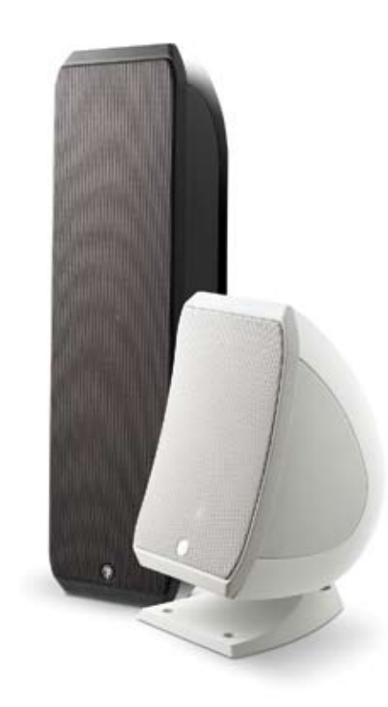
> Sib XL, Jet Black and Sib, Pearl White