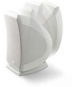
> Jointed and rotating loudspeaker

Technically, Sib & Co is not evolving, simply because this loudspeaker line has collected an impressive quantity of trophies in the international press thanks to its well-recognized technical qualities.